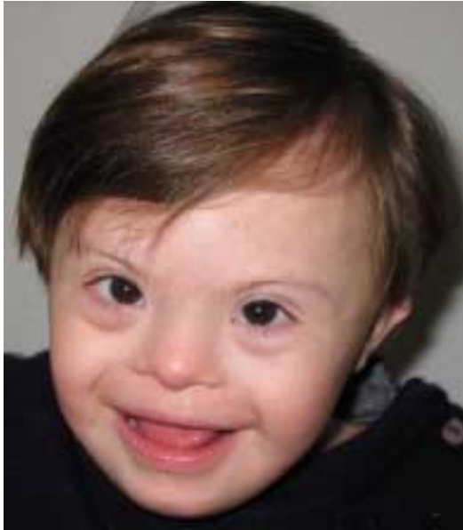
Figure 1: Frontal (a) and lateral (b) appearance of a patient with Down's syndrome