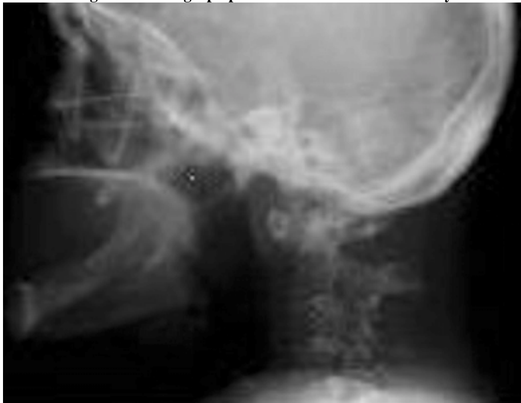
Figure 6: Radiograph picture of atlantoaxial instability

This is due to increased mobility at the atlantoaxial joint, probably due cervical vertebral or ligaments anomalies. It is recognised in about 15% of cases 14 and is usually asymptomatic and diagnosed by cervical spine radiography (fig 6). Symptomatic instability results from subluxation with injury of the spinal cord and neurological manifestations.